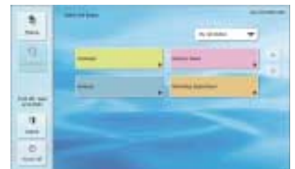
Job button screen

If you don't want to keep supplies of all the business cards you collect, you can simply scan them. ScanFront handles 3 cards at a time and even accommodates cards with embossed letters.