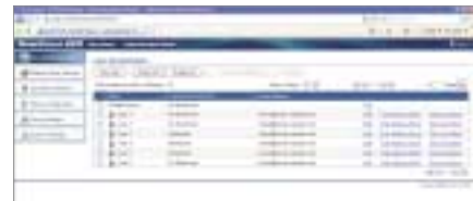
ScanFront 220/220P Web Menu

Work together better: share information whilst keeping it secure at the same time.