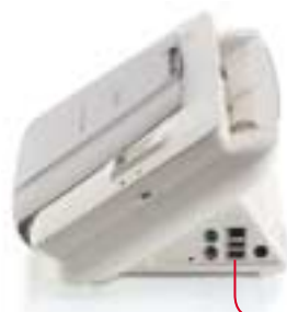
USB ports x 2 and ports for PS/2 keyboard & mouse